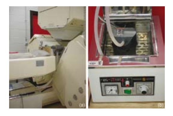
Figure 3. (a) Overview of SPECT scan setup. Triple head gamma cameras circle the water-based heated scanning bed. (b) water bath with aquariumpump for water circulation.