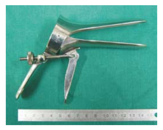
Figure 1. The speculum and its mechanics. The two branches were inserted vertically, thereby allowing access to the urethral orifice located on the ventral side of the vagina.

Consequently, the transvaginal-urethral catheterization was unavoidable. Unfortunately, the catheterization of female animals requires a certain level experience as described by DeLillo and Hansen (2008) in the case of dogs.