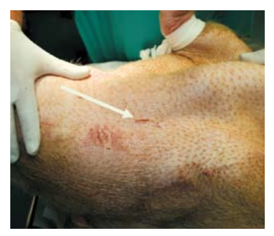
Fugure 4. The skin incision (arrow) beneath the larynx at the right hand side. The anaesthesized animal is fixated in the supine position.

infuse great amounts of fluid in a quick and safe manner.