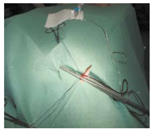
Figure 5. The jugular vein is carefully lifted out of the body and held by tweezers. The tube is inserted into the lumen as shown by its filling of blood. The ligature at the bottom of the figure is tightened in the apical direction while the ligature in direction of the heart is ready to be tightened as demonstrated by the prepared knot.

In the supine position, a cut with a length of approx. 4 cm was made 3-4 cm parallel to the median line beneath the laryngeal region (Fig. 4). Using long dissection scissors, the jugular vein was identified. The vein was gently lifted with a lid - retractor and held by tweezers above the skin's level (Fig. 5), thereby making the vessel easily accessible for manipulations. Next, the lumen was occluded through a ligature at the cranial end (POLYSORB®, tyco Healthcare Group LP, Norwalk, USA), so that the vessel drained. Following a small incision into the jugular vein, the catheter was inserted approximately 8 cm towards the heart. The correct position was determined by blood filling the tube which was then fixated in the vein by means of two ligatures. The skin was closed with monofil thread, covered with compresses, and fixed with a broad tape (Fixomull®, BSN Medical GmbH, Hamburg, Germany). The catheter was connected via a three-way valve with an administration set (R 87 RLS Luer-Lock IG-P Becton Dickinson GmbH & Co. KG Heidelberg, Germany) and saline (0.9 % NaCl, Delta Select, Pfullingen, Germany) was infused continuously.