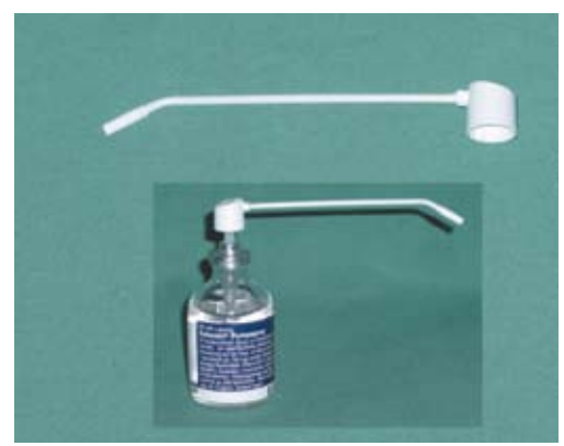
Figure 2. The nozzle (top) of the xylocaine spray (bottom) proved to be a useful instrument for probing the orifice and the urethra itself on account of its tip. During gentle insertion, xylocaine was applied, thereby lubricating, expanding and anaesthesizing the urethra. Once the nozzle was fully inserted, it was disconnected from the bottle and served as a guide for the catheter.

The transvaginal-urethral catheterization was carried out in an abdominal position with the hind legs stabilizing the pig. A gynaecological speculum (Fig. 1) was inserted into the vagina using Vaseline, a lubricant used for the urethral catheterization in men (Endosgel® steril, Farco-Pharma GmbH, Köln, Germany) as well as xylocaine spray (Xylocain Spray 2%, AstraZenca GmbH, Wedel, Germany) (Fig. 2). The lubricant and xylocaine were used to reduce friction and to prevent the vaginal mucosa from swelling, particularly in the urethral orifice. The speculum was inserted in a vertical fashion, thereby allowing unimpeded access to the urethral orifice, which is located in the ventral portion of the vagina (DeLillo D & B Hansen, 2008). The required degree of openness of the speculum was determined, then speculum branches were fixated in the appro-