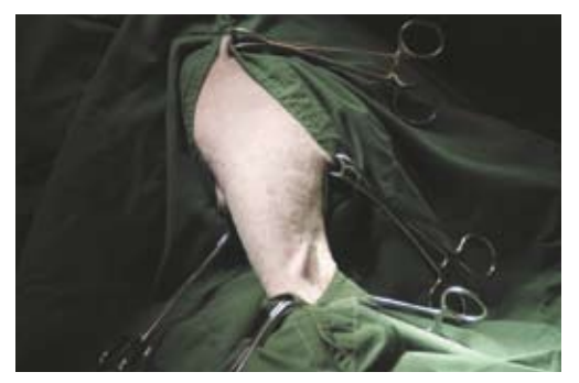
Figure 3. Covered operation field.

A skin incision about 12 cm in length was made in the middle third of the tibia at the lateral side. Fasciae were identified and cut in line with the skin incision.