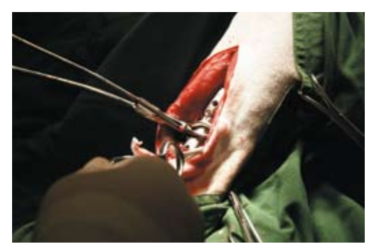
Figure 6. Plate on the bone with proximal intramedullary rod in its position.